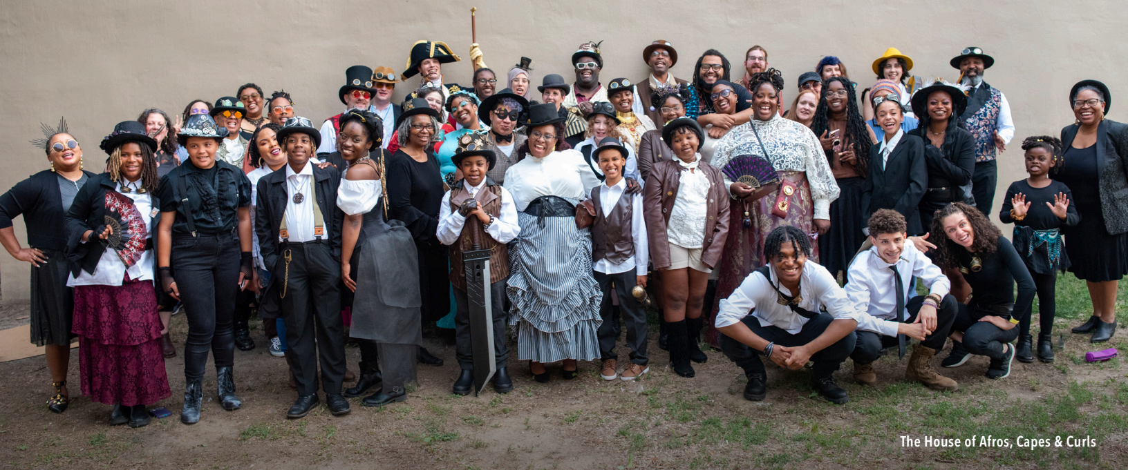
The House of Afros, Capes & Curls