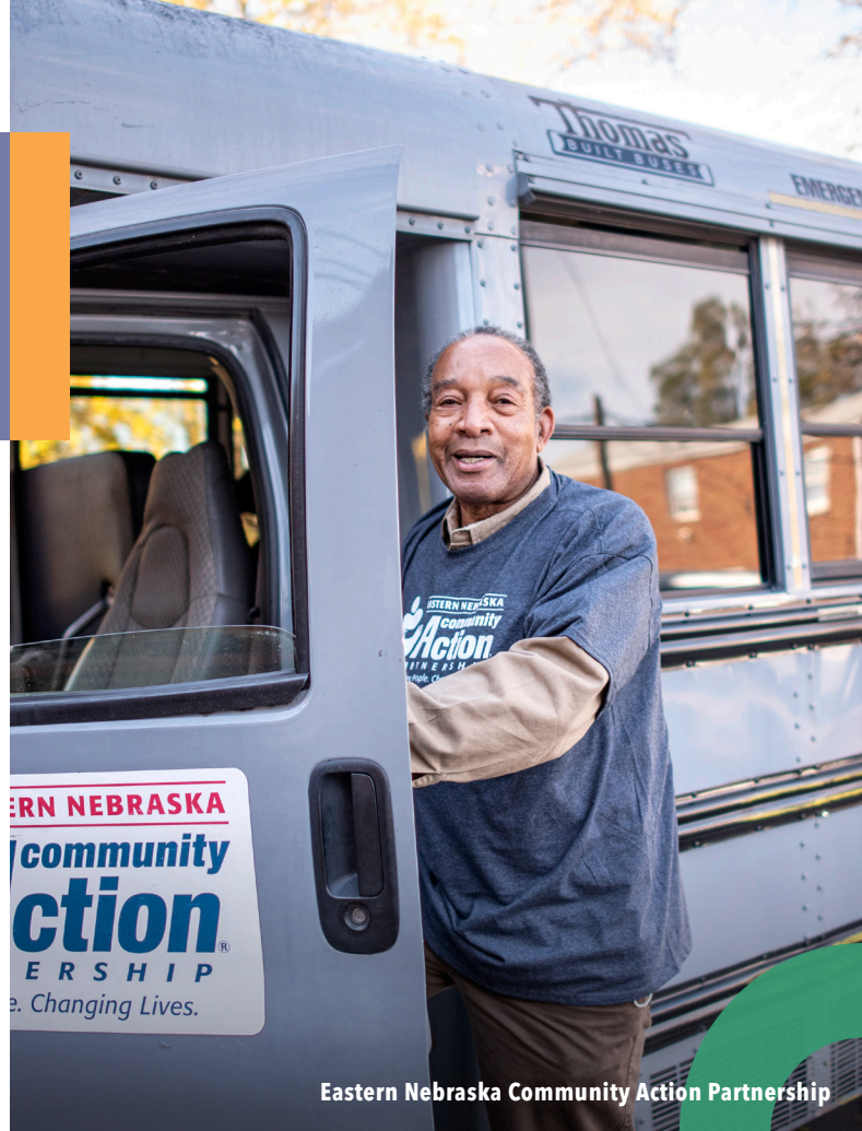
Eastern Nebraska Community Action Partnership