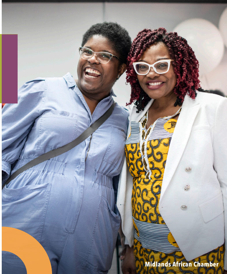
Midlands African Chamber