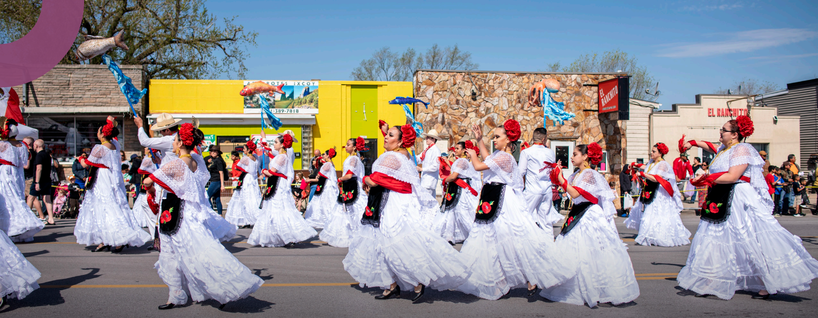
Cinco de Mayo Omaha Parade