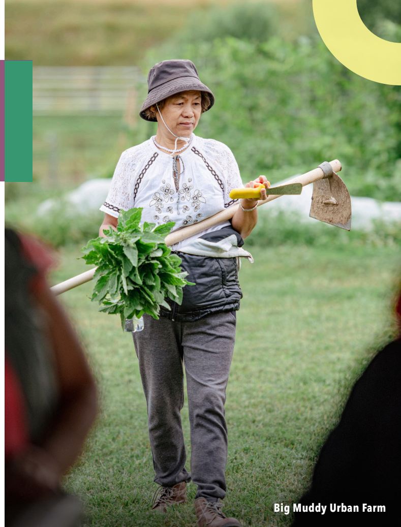
Big Muddy Urban Farm