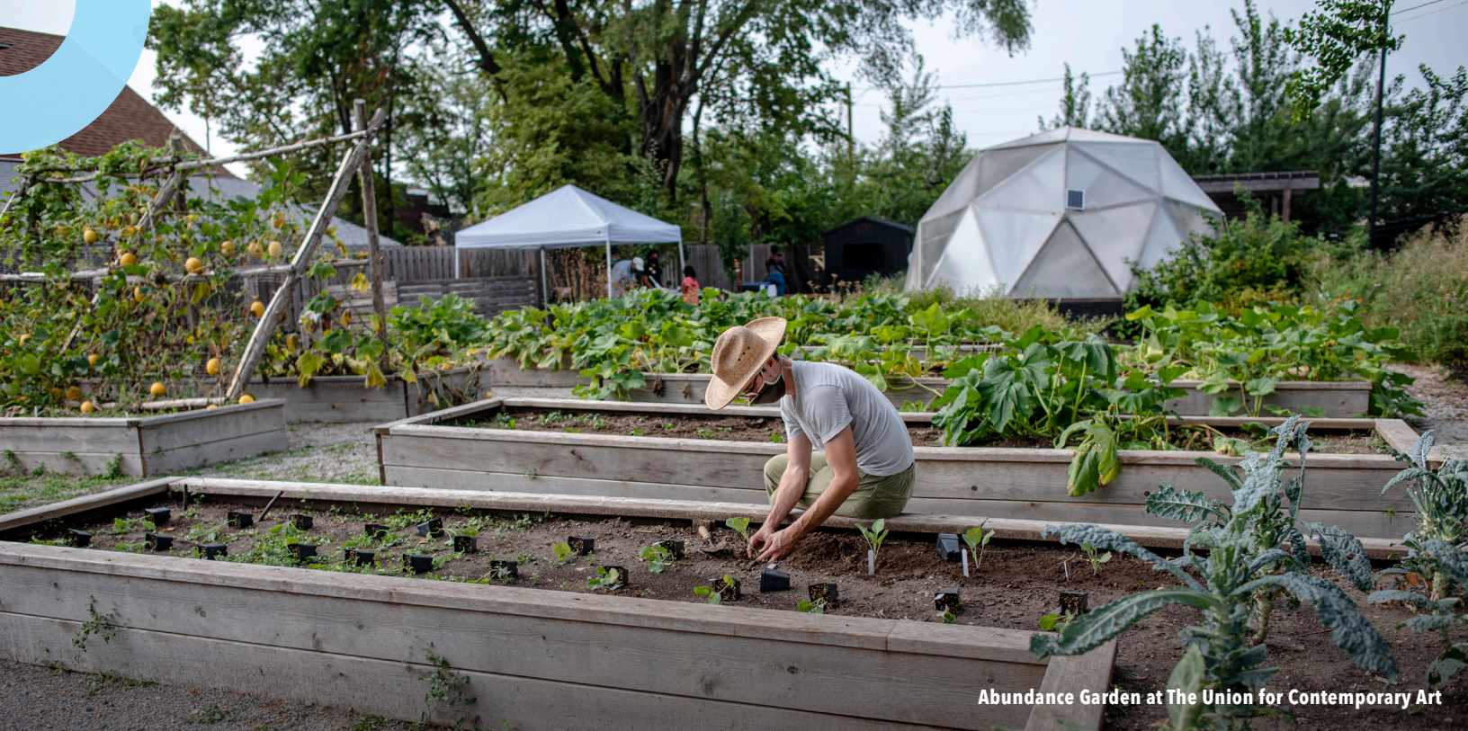
Abundance Garden at The Union for Contemporary Art